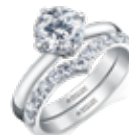
Page 19 ML546 & ML660