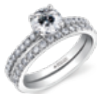
Page 18 ML616