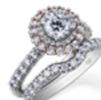
Page 20 ML593