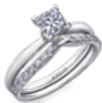
PRINCESS CUT Page 17 ML571