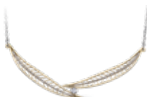
Page 21 ML642