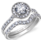
Page 20 ML429