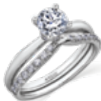
Page 17 ML376