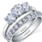
Page 18 ML549