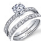
Page 25 PC225