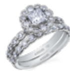
PRINCESS CUT Page 23 ML386