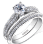
Page 17 ML646