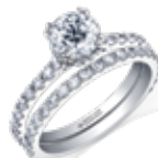
Page 17 ML648