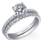
Page 17 ML570