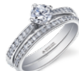
Page 10 ML761