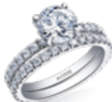
Page 14 ML870