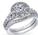
Page 18 ML384