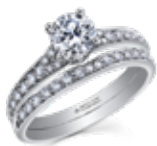
Page 14 ML316