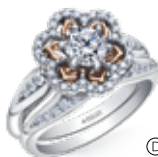
Page 5 ML892