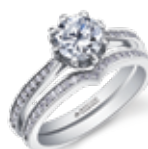
Page 13 ML739