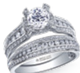
Page 12 ML310