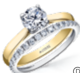
Page 6 ML869