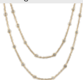
Page 17 ML865