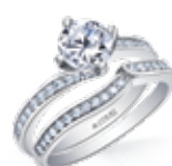
Page 13 ML875