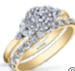
Page 11 ML891