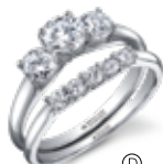
Page 6 ML110