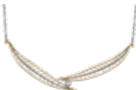
Page 19 ML642