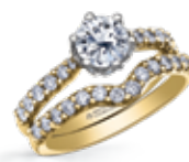
Page 18 ML455