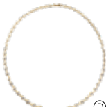
Page 7 ML866