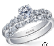
Page 6 ML889