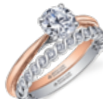
Page 10 ML741