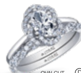
OVAL CUT Page 8 ML890