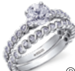
Page 11 ML512