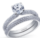
Page 13 ML262