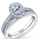
OVAL CUT Page 12 ML872