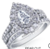
PEAR CUT Page 4 ML877