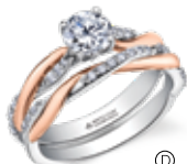
Page 6 ML728