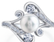
Page 9 ML880