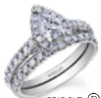
PEAR CUT Page 10 ML578