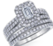
EMERALD CUT Page 12 ML871