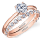
Page 16 ML811