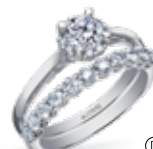
Page 6 ML876