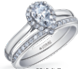
PEAR CUT Page 12 ML167