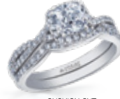
CUSHION CUT Page 12 ML395