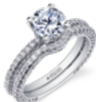
Page 15 ML797