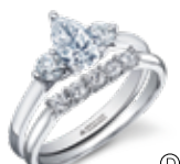
PEAR CUT Page 6 ML874