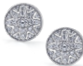
Page 18 ML408