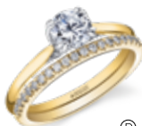
Page 11 ML820