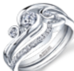
Page 10 ML127