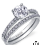
Page 6 ML500